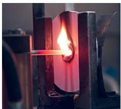
IEC 灼热丝可燃性/ IEC 灼热丝点燃

ISO/IEC/ASTM 让用户大体了解增材制造的基本原理, 并明确了解相关术语的定义。标准化 AM 术语使参与该领域的人员更容易在世界各地进行交流。